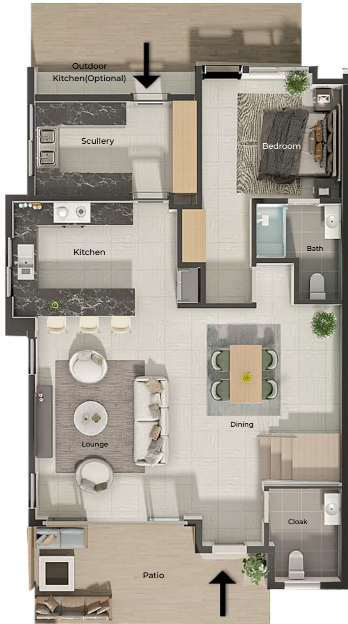
Ground Floor ( Staff Quarters)